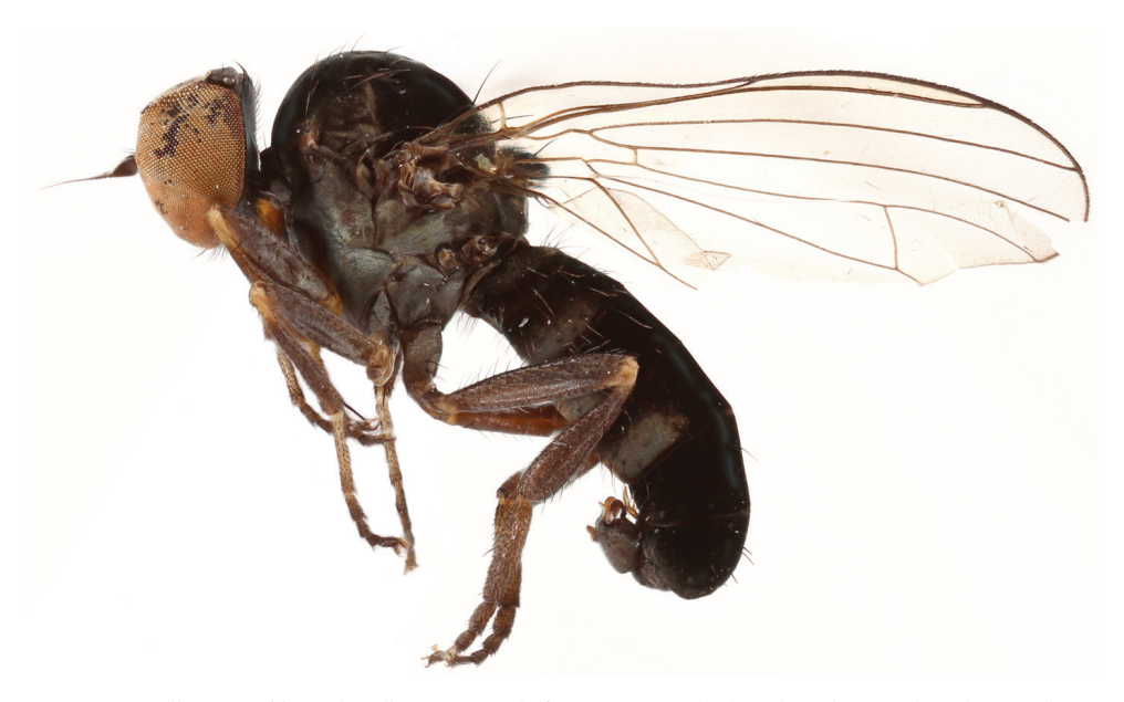
Figure 9. Callomyia saibhira Chandler, 1976, male from Romania: body in lateral view.