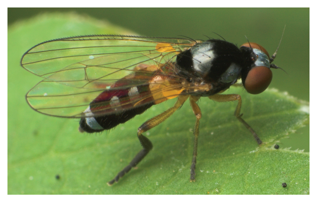
Figure 8. Callomyia elegans Meigen, 1804, female habitus.

Distribution. Palaearctic species. Recorded in Andorra, Austria, the Czech Republic, Finland, France, Germany, Great Britain, Hungary, Ireland, Italy, Lithuania, the Netherlands, Norway, Poland, Slovakia, Sweden, Switzerland, Romania and Russia (ER).