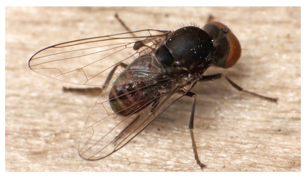
Figure 13. Polyporivora ornata (Meigen, 1838), male habitus.

Material examined. 1 ♂, 19. v. 2011, Alba, Alba Iulia, 1 km E, 380 m a.s.l., 46°04′18″N, 23°32′02″E, sweeping on Fagus sylvatica , MT leg.