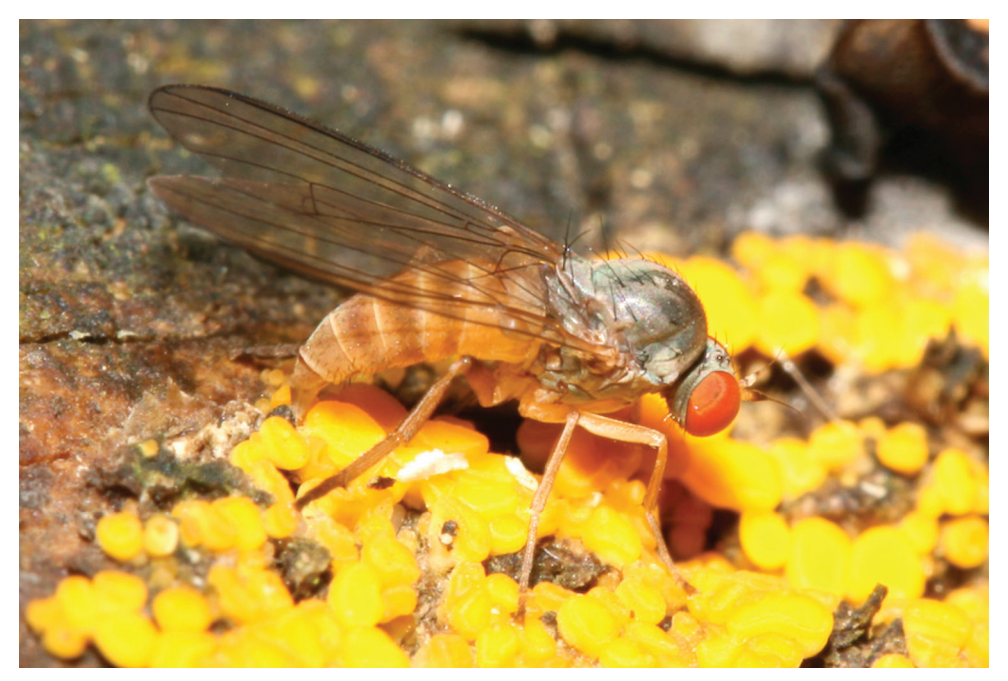
Figure 3. Agathomyia falleni (Zetterstedt, 1838), female ovipositing on undetermined yellow slime mold (Mycetozoa) on stump overgrown by Bjerkandera adusta .