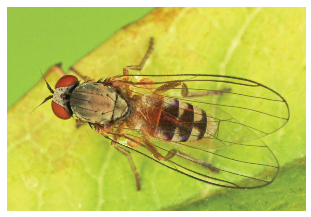
Figure 4. Agathomyia setipes Oldenberg, 1916, female showing abdominal pattern.