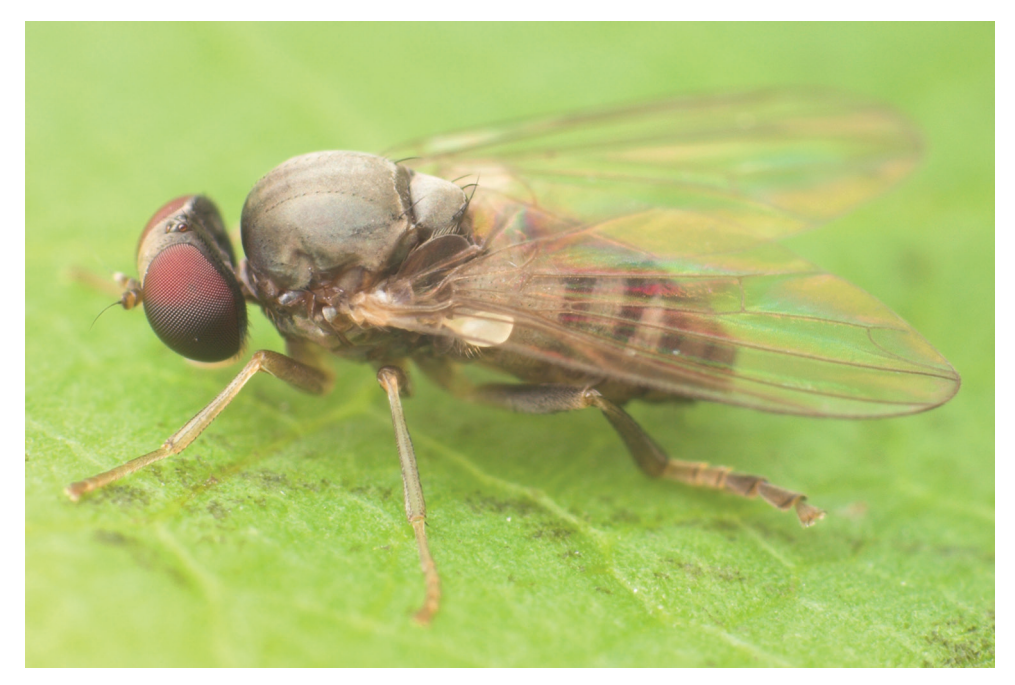
Figure 16. Lindneromyia hungarica Chandler, 2001, female habitus.

Distribution. Palaearctic species. Recorded in Austria, the Czech Republic, France, Germany, Great Britain, Hungary, Portugal, Slovakia, Spain and Switzerland. New record for Romania.