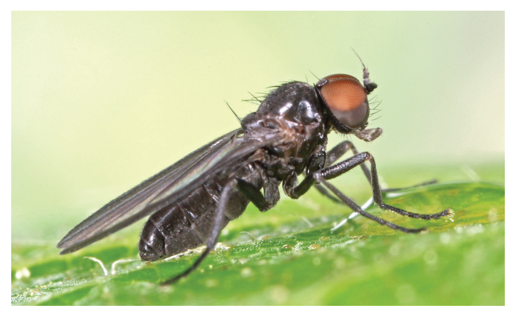
Figure I. Opetia nigra Meigen, 1830, male habitus.