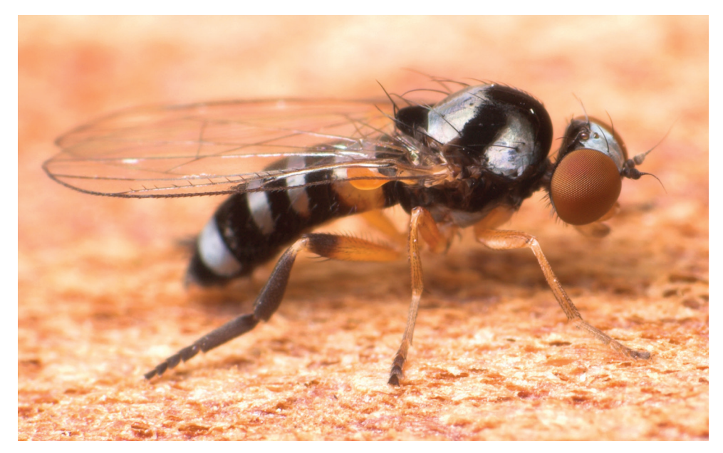
Figure II. Callomyia speciosa Meigen, 1824, female habitus.

Material examined. 1 \circlearrowleft , 31. v. 2011, Banat, Sfânta Elena, 1 km E, Alibeg brook valley (Figure 18), 230 m a.s.l., 44^{\circ}40'37"N , 21^{\circ}43'32"E , sweeping undergrowth of deciduous forest, JR leg.; 1 \circlearrowleft , 1 vi. 2008, Banat, Sfânta Elena, 4 km NE, Kulhavá skála, Vranovec cave (Figure 17), 300 m a.s.l., 44^{\circ}42'12"N , 21^{\circ}43'52"E , sweeping vegetation along brook, JR leg.; 1 \circlearrowleft , 3. vi. 2008, Banat, Sfânta Elena, 1 km E, Alibeg brook valley (Figure 18), 230 m a.s.l., 44^{\circ}40'37"N , 21^{\circ}43'32"E , sweeping vegetation along brook, JR leg.