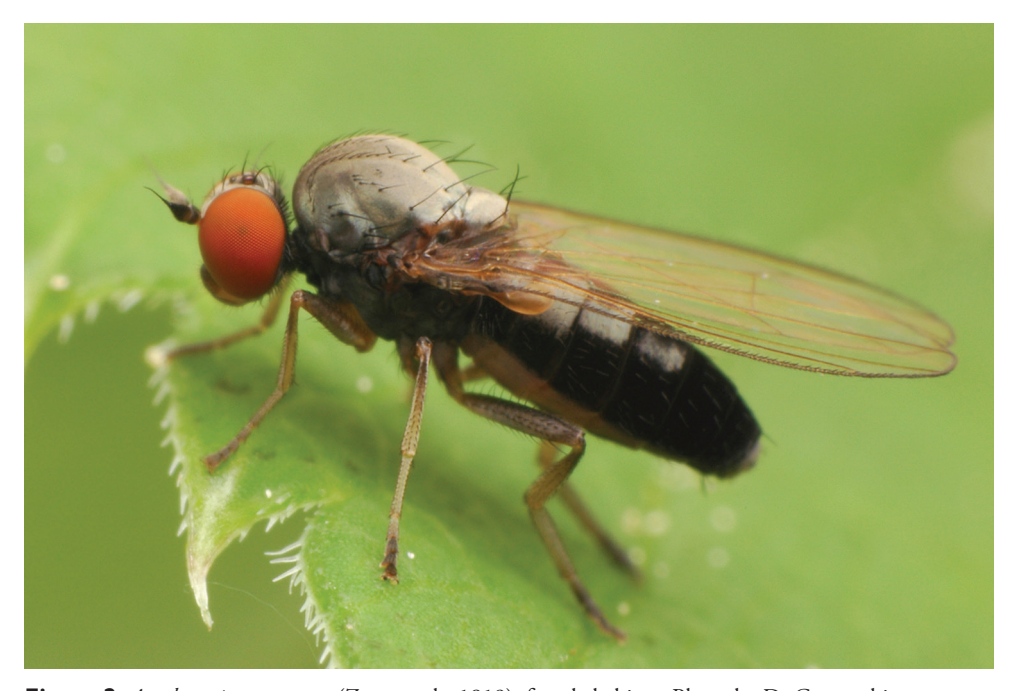
Figure 2. Agathomyia antennata (Zetterstedt, 1819), female habitus.

deciduous forest, JR leg.; 3 \subsetneq \subsetneq , 1. vi. 2008, Banat, Sfânta Elena, 4 km NE, Kulhavá skála, Vranovec cave (Figure 17), 300 m a.s.l., 44^{\circ}42'12"N , 21^{\circ}43'52"E , sweeping vegetation along brook, JR leg.; 1 \subsetneq , 4. vi. 2008, Banat, Berzasca, 2 km NE, Berzasca