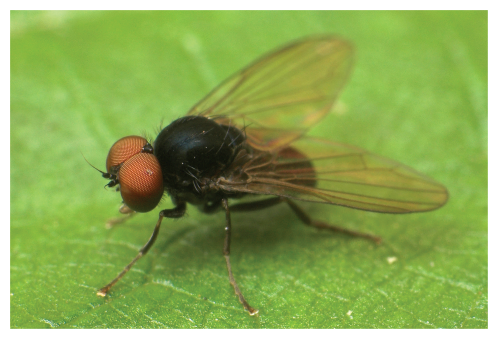
Figure 12. Seri obscuripennis (Oldenberg, 1916), male habitus.

Distribution. Palaearctic species. Recorded in Austria, the Czech Republic, Finland, Germany, Great Britain, Hungary, the Netherlands, Norway, Poland, Romania, Slovakia, Sweden, Switzerland and Russia (ER, FE).