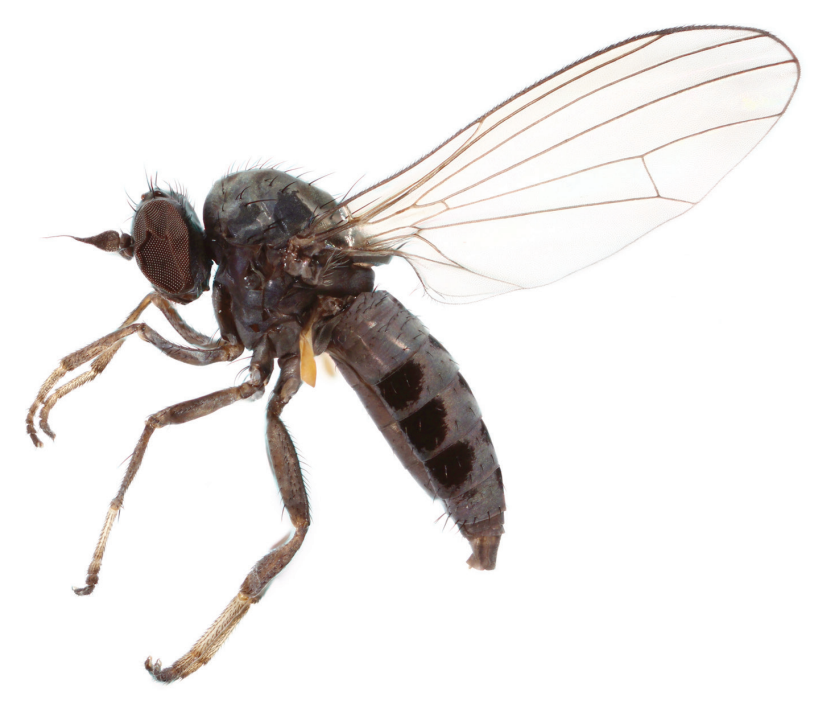
Figure 5. Agathomyia vernalis Shatalkin, 1981, female habitus in lateral view.