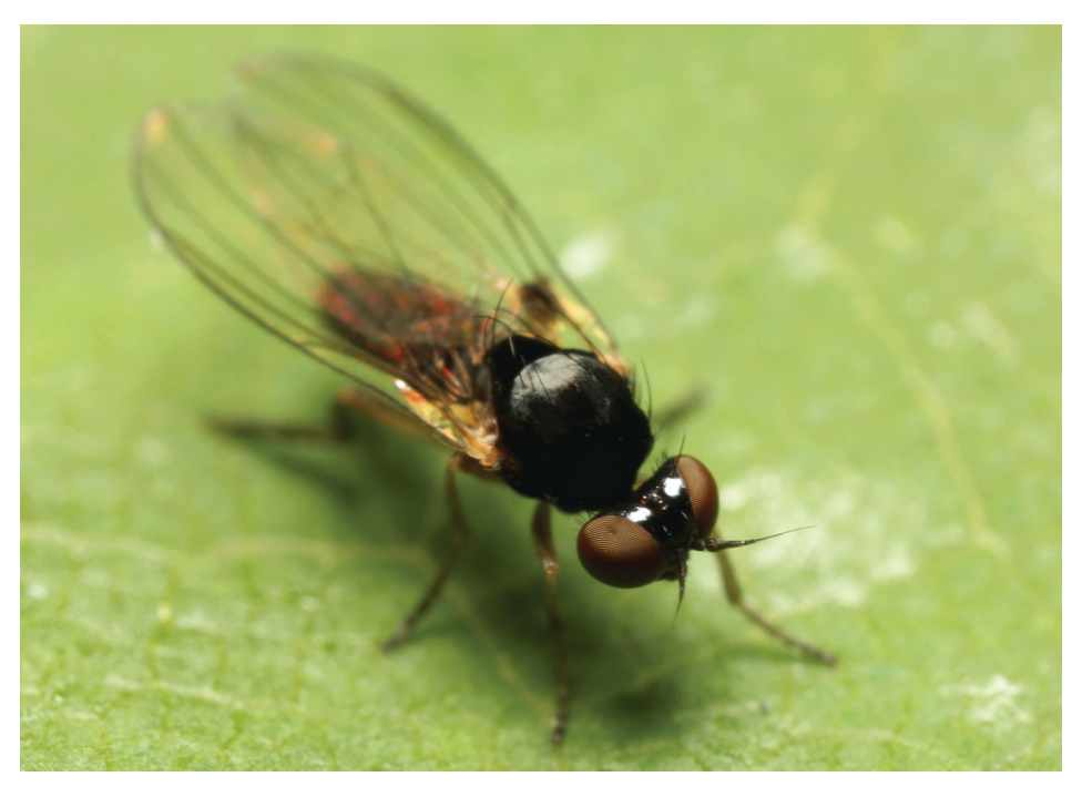
Figure 6. Agathomyia viduella (Zetterstedt, 1838), female habitus. Note the glossy frons as the main diagnostic character of females of this species.