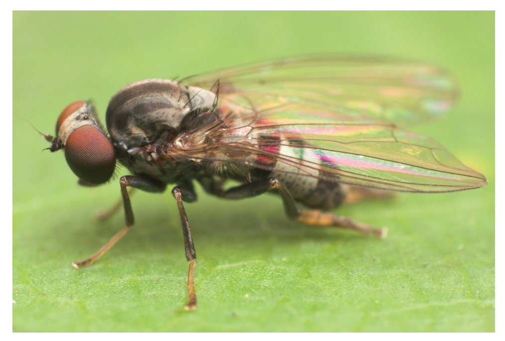
Figure 14. Paraplatypeza bicincta (Szilády, 1941), female habitus.