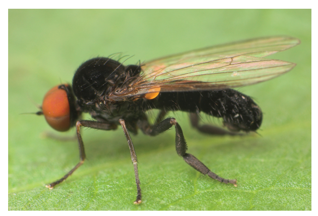
Figure 7. Callomyia amoena Meigen, 1824, male habitus.

Calana [Hobița, Hunedoara], 29. vi. 1969, in mature pine forest, B.H. Cogan and R.I. Vane-Wright leg. (BMNH) (Chandler 2001, in litt.).