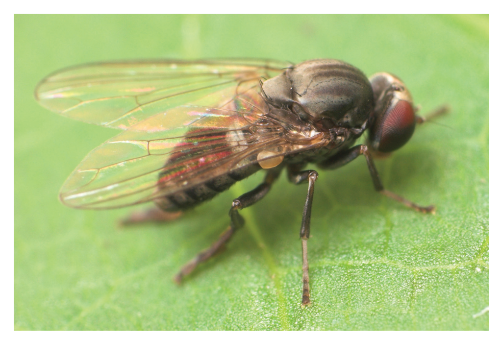
Figure 15. Lindneromyia dorsalis (Meigen, 1804), female habitus.

Distribution. Palaearctic species. Recorded in Andorra, Austria, Belgium, Cyprus, the Czech Republic, Denmark, France, Germany, Great Britain, Greece, Hungary, Italy, Israel, Morocco, the Netherlands, Poland, Portugal, Romania, Slovakia, Spain, Switzerland, Turkey and Russia (ER).