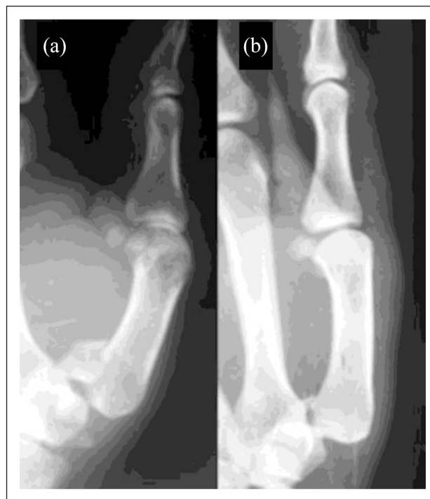
Figure 1. Bennett fractures with large (a) and small (b) fragments.

After applying the exclusion criteria that were pathological and open fractures, surgical techniques other than the Iselin's method, incomplete records and follow-up period of less than 6 months, the records of 40 patients were enrolled and reviewed retrospectively and epidemiological, clinical, histological and therapeutic data were collected.