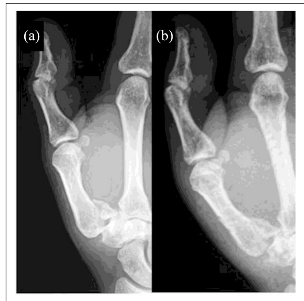
Figure 4. Displaced large fragment fracture (a) treated with CRPP with final X-ray showing malunion with an articular step-off greater than 2mm (b).

Very good results: Kapandji score from 9 to 10