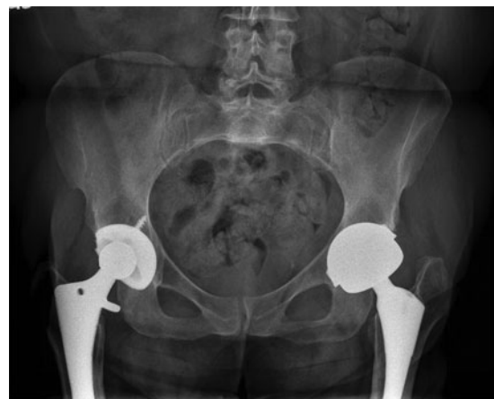
FIG. 1. AP pelvis radiographs show right metal-on-polyethylene THA and left metal-on-metal THA. Components appear in appropriate positions without obvious signs of loosening. AP, anterior-posterior; THA, total hip arthroplasty.

Initial radiographs showed a well-positioned right THA with some eccentric wear of her polyethylene. The left hip radiographs showed an MoM arthroplasty with a well-fixed stem and the acetabular component in the appropriate position, without signs of loosening (Fig. 1).