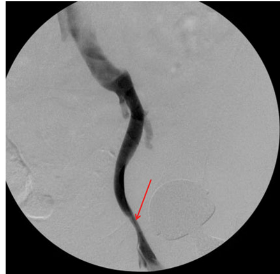
FIG. 3. Venogram of external iliac vein performed intraoperatively by vascular surgery team showed ~70% compression in area of pseudotumor (arrow).

After risks and benefits were discussed, the patient elected to proceed with surgery for revision left THA and pseudotumor decompression in a combination case with vascular surgery. Before incision, a fluoroscopic venogram showed ~70% stenosis of the left external iliac vein without evidence of any thrombus. Vascular surgery deemed that no further intervention would be required at that time (Fig. 3). Revision THA was then performed via a standard posterior approach. A large quantity of dark brown, brackish fluid was