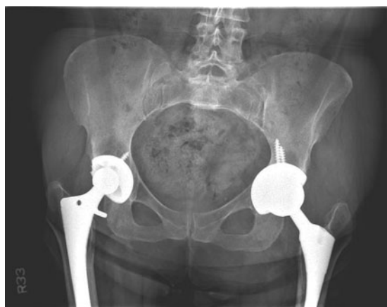
FIG. 4. Revision left THA to metal-on-polyethylene construct.