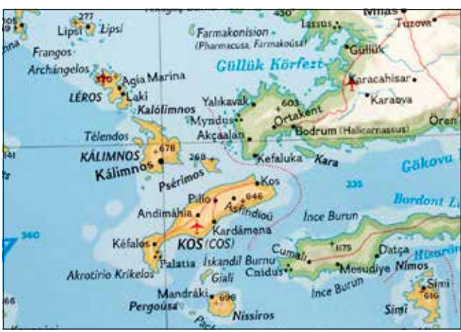
Fig 1. Kos Island. It is close to the Turkish coast in the Dodecanese Islands, South-East Aegean Sea

The Oriental Plane Tree (Platanus Orientalis), not to be confused with the better known London Plane Tree (Platanus Acerifolia), is one of Europe's longest-lived trees. A native of SE Europe and Asia Minor, it is occasionally found in British parks and gardens, having been cultivated there since the sixteenth century. It can reach 100 feet in height and grows well in open ground, its branches, with their broad palmate leaves, spreading widely from a relatively short and rugged trunk. Its longevity is well attested. A group of trees by the Bosporus are said to have sheltered the crusading knights of Godfrey de Bouillon in the eleventh century. However, the specimen best known to the medical profession is the tree on the Aegean island of Kos (Fig 1), sometimes claimed to be over 2400 years old, under which Hippocrates, the 'father of medicine', who practised in the 5th century BC, reputedly sat to consult and teach1.