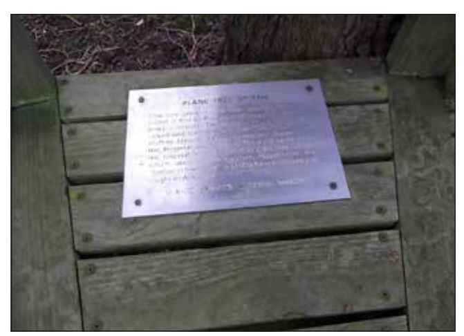
Fig 17. The Wakehurst tree plaque. This is the original plaque

The achievements have indeed been great. Advances in nephrology (without which Dimitrios would not have come to Belfast) have led to both dialysis and renal transplantation, outstanding bio-engineering and medical triumphs of the twentieth century. The developments on the BCH site since 1987 are evidence of similar progress in other disciplines. But there are also faults. Prominent among these is the perennially recurring failure to remember that medicine, however well based in science, is also a humane activity that must be founded on a continuity of care, compassion and morality. The story of the trees, their connection to the historical permanence of medical care, and their present plight may serve as a reminder of that obligation.