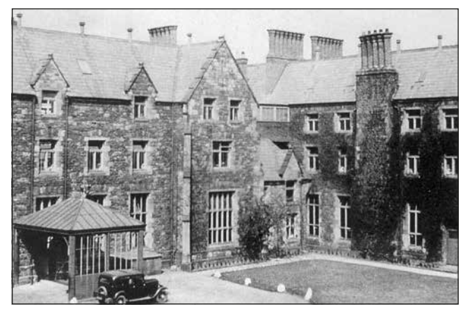
Fig 3. The Union Infirmary. Converted from the First School House in 1875, it was the main entrance to the hospital until the opening of the BCH Tower.

unit<sup>2</sup>. Beyond all these was the planned site redevelopment by the Hospitals Authority, which would bring into being the BCH Tower (Fig 4). The conditions, as proposed above, for an interest in acquiring plane trees of Kos were thus clearly present.