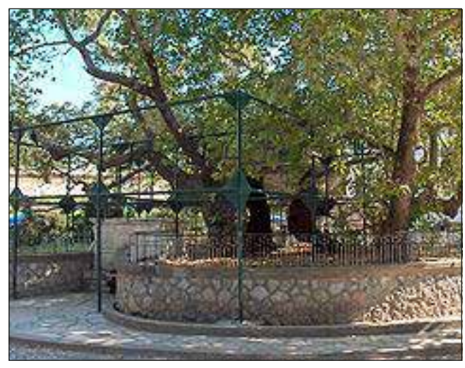
Fig 2. The plane tree in Kos town.

mysticism, the aptness of his many attributed aphorisms and the importance he placed on the moral and professional aspects of Medicine, as revealed in the Hippocratic Oath taken by doctors on graduation, all continue to resonate today. Possession of a tree of Kos can be seen as a gesture of respect to the continuity of Medicine as a rational science and a humane art. It is likely to appeal to institutions which take pride in their achievements and are optimistic for their future development.