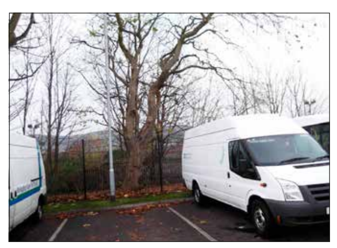
Fig 14. The Renal Unit tree, December 2012. It forms part of the ambulance park perimeter.

but the beneficence of members of the former Medical Staff Committee is suspected. At first sight, the tree seems to have a secure future. Unfortunately, the reverse may be true. This tree, the only flourishing survivor of the original donation, may now be scheduled for demolition as part of the development of acute mental health services on the site