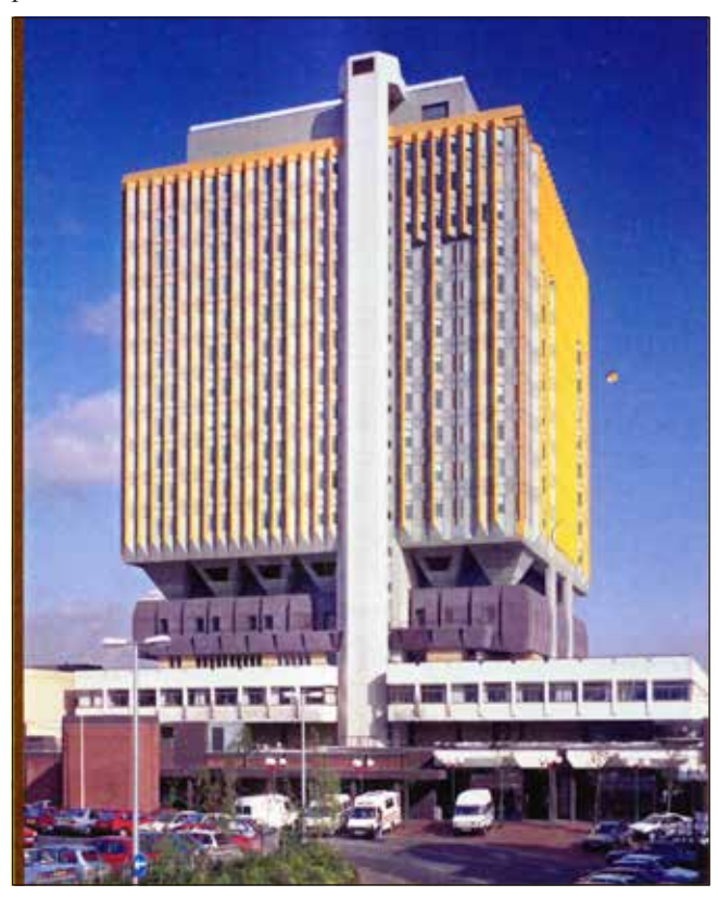
Fig 4. The BCH Tower. Patients began to arrive in November 1985.

unit<sup>2</sup>. Beyond all these was the planned site redevelopment by the Hospitals Authority, which would bring into being the BCH Tower (Fig 4). The conditions, as proposed above, for an interest in acquiring plane trees of Kos were thus clearly present.