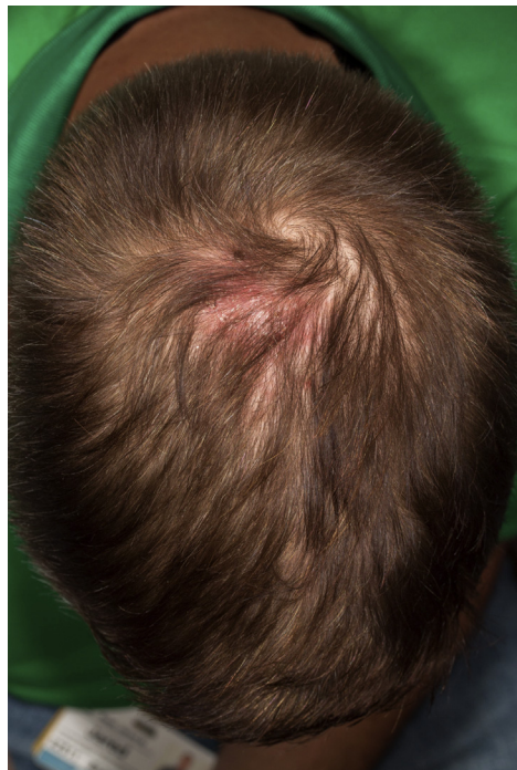
Fig 1. Erythematous scaly plaque on the vertex of the scalp.