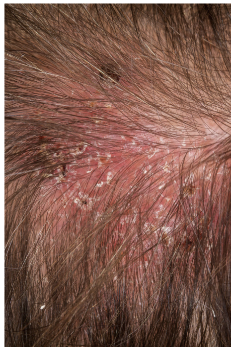
Fig 2. Close up of erythematous scaly plaque.

for bacteria, atypical mycobacteria, and fungus were performed. His immunosuppressive therapies were temporarily stopped. Histopathology showed epidermal erosion, a dense mixed inflammatory infiltrate, and rare fungal spherules within granulomatous inflammation (Fig 3). Tissue culture results were positive for Coccidioides posadasii/immitis and coagulase-negative Staphylococcus . Mycobacterial culture result was negative. Serum Coccidioides immunoglobulin (Ig) G and IgM were positive by enzyme immunoassay, and Coccidioides antibody titer was 1:64 by complement fixation.