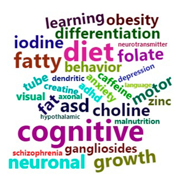
Figure 2. Graphical representation of the nutrients and neurodevelopmental outcomes most frequently encountered during the review. The chosen terms were based on the extraction of data from all included articles using the R cloud program.