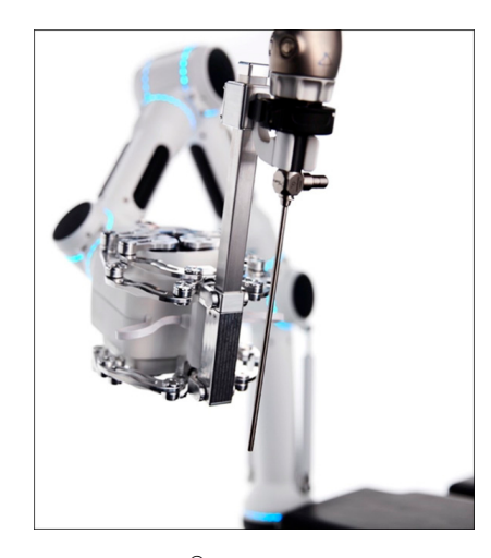
Figure 6. Cirq<sup>®</sup>. Robot-assisted endoscope guidance system with a mechatronic arm consisting of several segments with 7 degrees of freedom and the possibility to attach a conventional endoscope.

continuum robot [40,47]. A computer-controlled endoscope holding system called Cirq (Medineering/Brainlab, Munich, Germany) acquired approval for clinical application in 2017 (Figure 6). Since then, it could be shown that this system is feasible for surgery of the nasolacrimal duct. Commercial availability is currently pending [48].