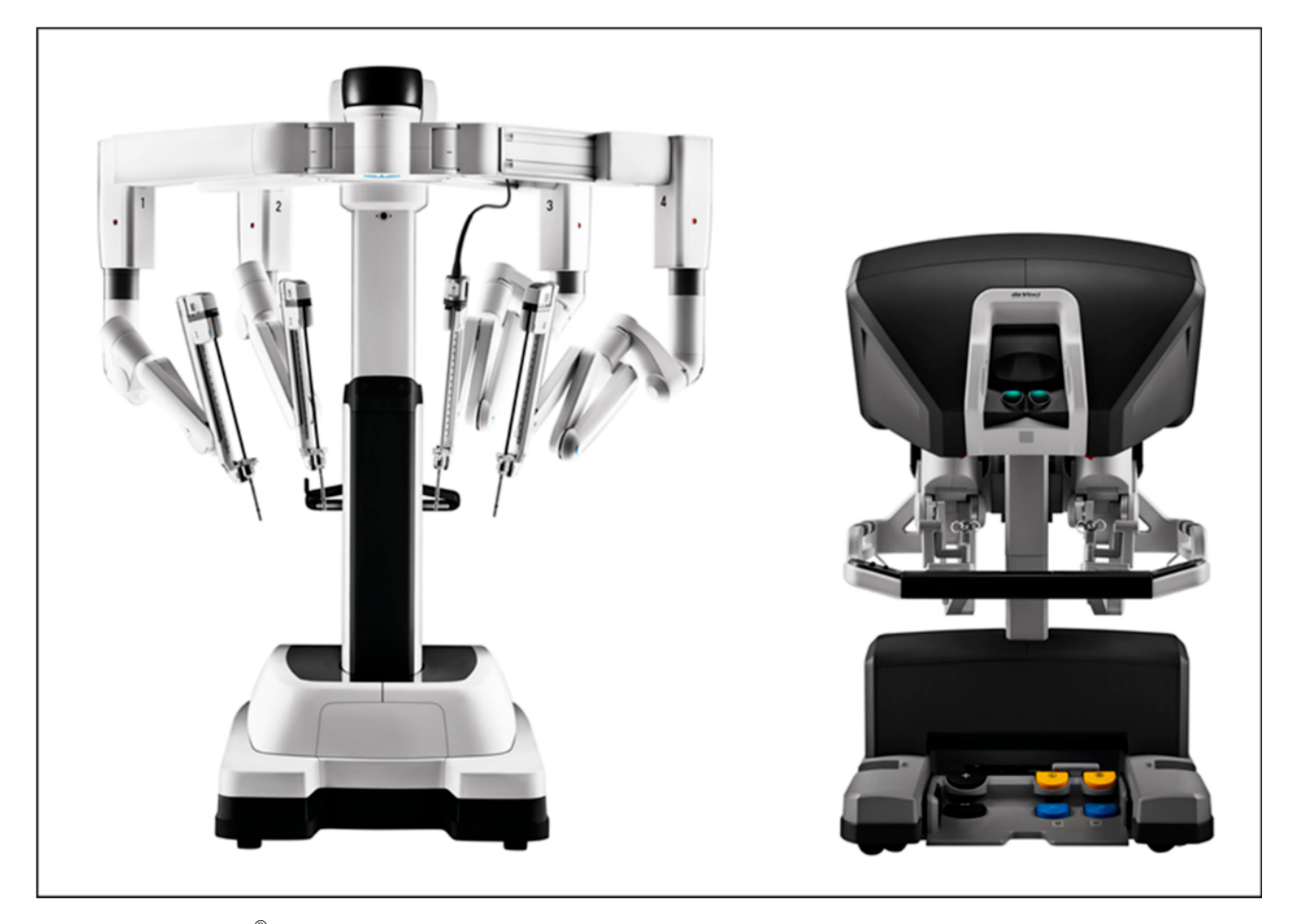
Figure 1. DaVinci Xi<sup>®</sup>. Multi-port robotic system with camera arm and several working arms for the use of different surgical instruments.

Currently, the global market leader for robot-assisted surgery is Intuitive Surgical (Sunnyvale, CA, USA), which distributes the world-wide known DaVinci system (Figure 1).