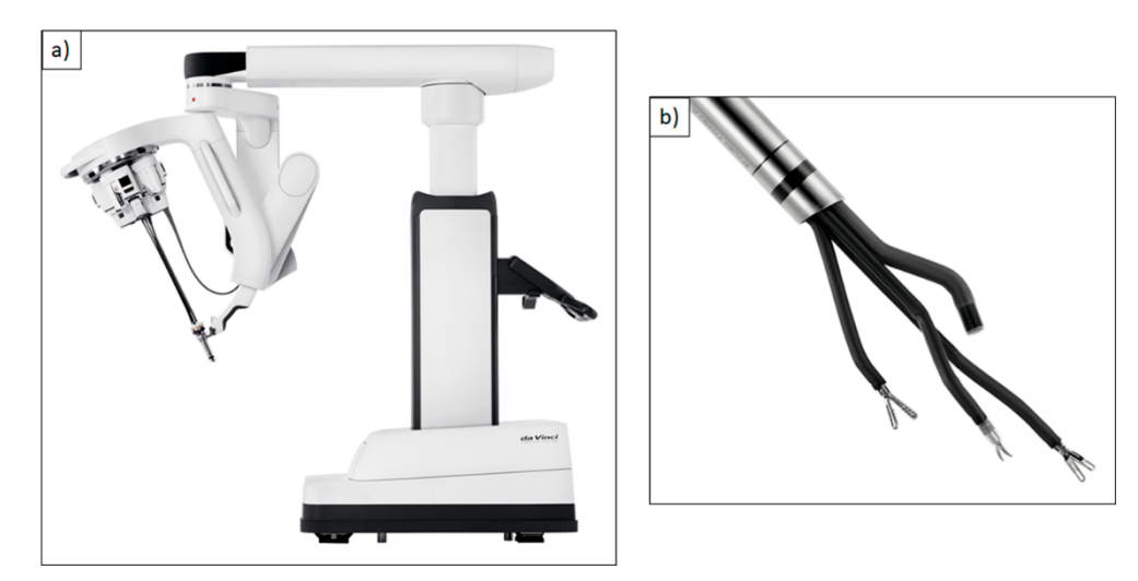
Figure 3. (a) DaVinci Single-Port (SP)<sup>®</sup> robotic system; (b) Single 2.5 cm cannula containing three instrument arms and an endoscope.

Several clinical trials describe successful procedures on a total of 88 patients with oropharynx cancers [21,22]. Advantages in comparison to the preceding model can be seen in improved visualization and a revised surgical instrument handling.