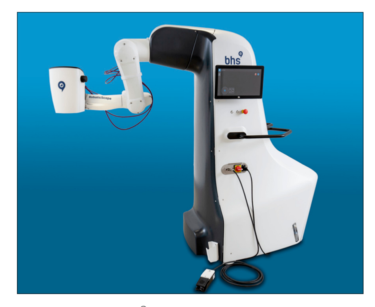
Figure 4. RoboticScope<sup>®</sup>-system with a high-resolution 3D-camera and a head-mounted display.

position without disconnecting the view of the surgical field. Depending on model and provider, they can include many more functions. One example of such an exoscope system is the RoboticScope of the company BHS Technologies (Figure 4).