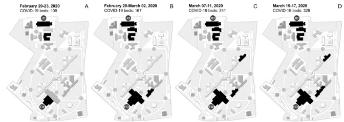
Figure 1 Reorganisation at Luigi Sacco University Hospital (LSUH) to increase the number of COVID-19 dedicated beds and wards (in black) during the the first weeks of the epidemic in Lombardy. ER, emergency room; ID, infectious diseases department.

This cohort study evaluated the dynamics of SARS-CoV-2 seroprevalence among the hospital's HCWs between 21 February and 27 May 2020. All of the hospital personnel (696 nurses, 346 doctors, 205 health service assistants including cleaners, 188 administrative staff and 115 healthcare technicians) were invited to participate in the 3-month serological survey on a voluntary