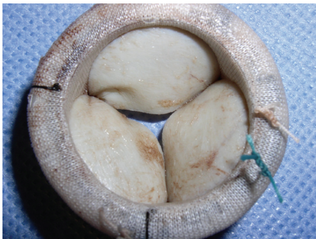
Figure 3. Infected prosthetic aortic valve. Notice the irregularities on the leaflet surfaces of the removed prosthetic valve.

the need to recognize Candida lusitanae fungemia as a life-threatening infection in a patient with a prosthetic aortic valve.