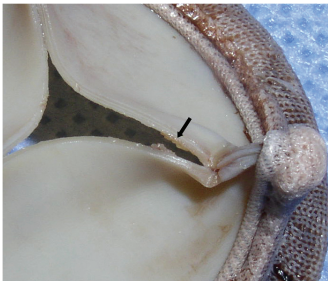
Figure 4. Prosthetic aortic valve vegetation. Black arrow indicates a vegetation on the removed prosthetic valve.

We describe a case of prosthetic valve endocarditis with Candida lusitanae following AVR in an immunocompetent patient. To our knowledge, this is only the second reported case of prosthetic valve endocarditis due to this uncommon Candida species. In vitro testing demonstrated that our isolate was sensitive to amphotericin B, caspofungin