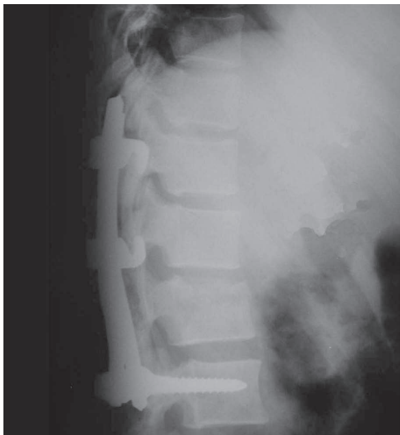
Figure 1 – Initial radiograph (lateral view) on patient with L1 burst fracture who was neurologically intact