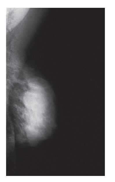
Figure 2. Mammography of the right breast (mediolateral oblique view). Mammographic sensitivity decreased due to the increased density of the fibroglandular breast tissue.