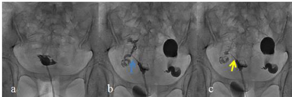
Fig. 2 Young female in the chitosan injection group (32 years of age). a Selective salpingography showed the right fallopian tube completely obstructed at the preoperative stage. b Selective salpingography showed the right fallopian tube unobstructed 1 day after interventional

recanalization. The blue arrow shows the right tubal completely recanalized. c Selective salpingography showed the right fallopian tube partially obstructed in the postoperative 12 months. The yellow arrow shows the right tube partially recanalized