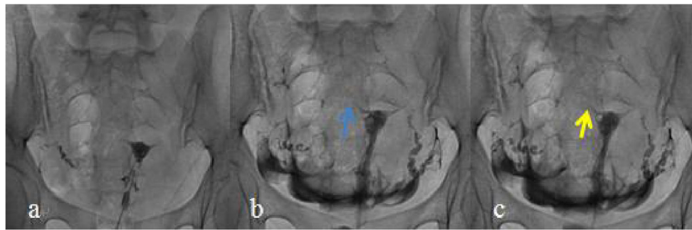
Fig. 4 Young female in the combined chitosan and Dan-shen injection group (28 years of age). a Selective salpingography showed the left fallopian tube completely obstructed at the preoperative stage. b Selective salpingography showed the right fallopian tube unobstructed

1 day after interventional recanalization. c Selective salpingography showed the right fallopian tube unobstructed in the postoperative 12 months