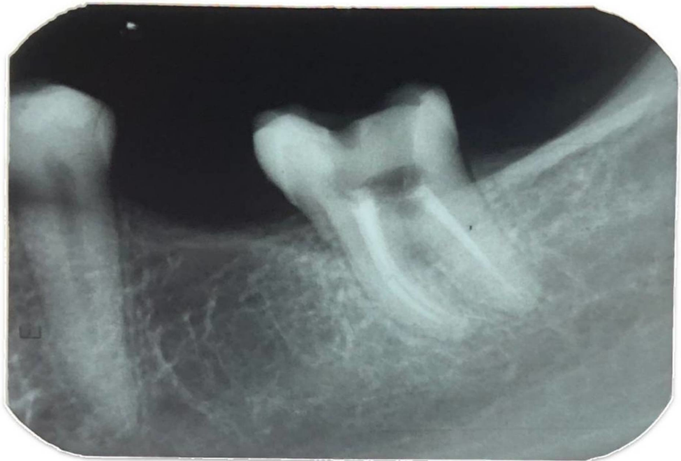
FIGURE 2: Preoperative Intraoral Radiograph

The tooth had no pain, probing pocket depth, and mobility associated with it. A provisional diagnosis of a gingival polyp was given. An intraoral periapical radiograph was taken, and it revealed no crestal bone loss or bone loss involving the furcation. However, radiolucency was seen on the distal surface of the tooth near the cemento-enamel junction (Figure 2).