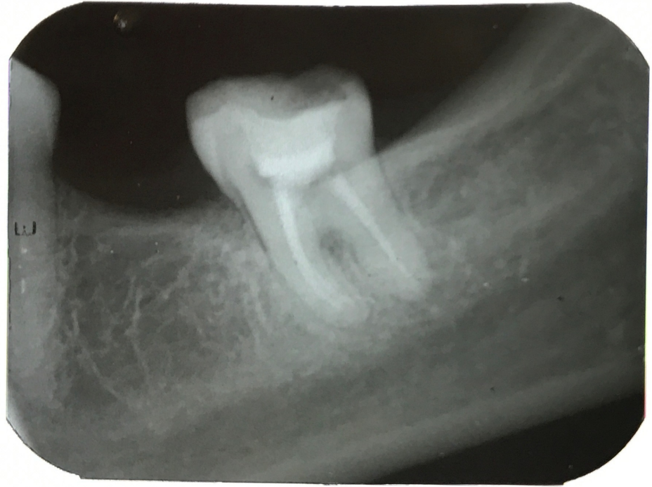
FIGURE 5: Postoperative Intraoral Radiograph

No antibiotics or analgesics were prescribed postoperatively. Oral hygiene instructions were given to the patient.