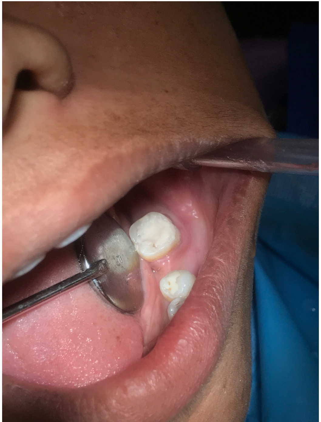
FIGURE 4: Final Postoperative

A periapical radiograph was taken to confirm the seal postoperatively (Figure 5).