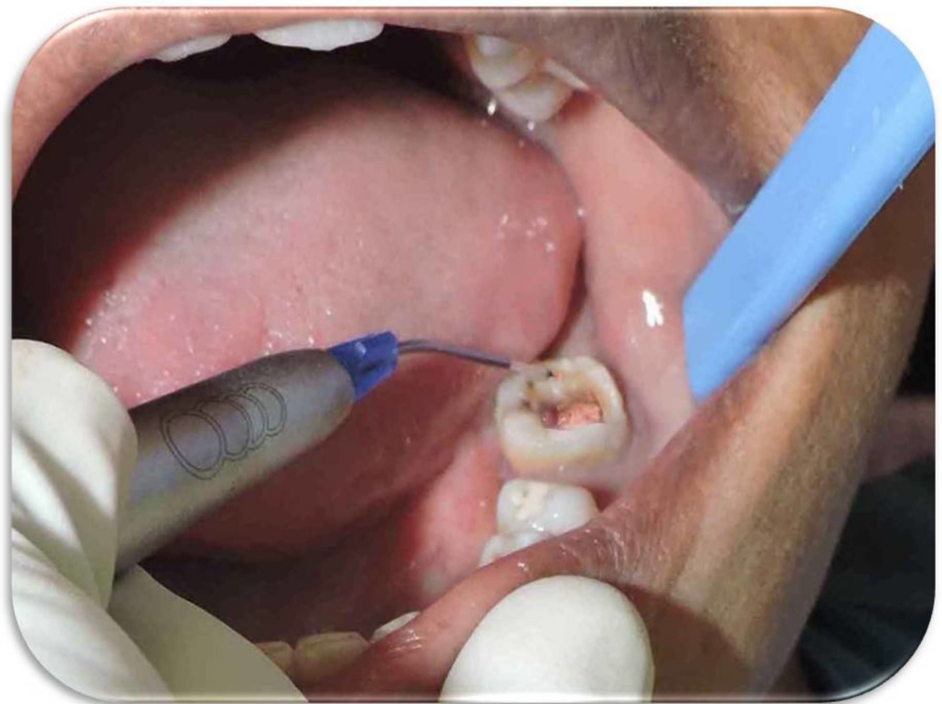
FIGURE 3: Laser-assisted Excision of the Growth

The treatment plan included laser-assisted excision of the polyp followed by the restoration of the perforation with mineral trioxide aggregate (MTA). After obtaining informed consent from the patient, initial cause-related treatment was carried out, following which the patient was taken up for the procedure. After sufficient anesthesia was given, laser-assisted excision was carried out with a diode laser (BioLase ezlase™ 940; BioLase, CA, US), as shown in Figure 3.