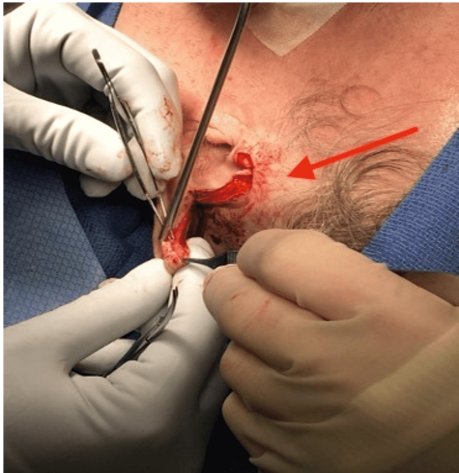
FIGURE 2: Intraoperative complex ear reconstruction.

The red arrow demonstrates helical root realignment and approximation into the temporal fascia.