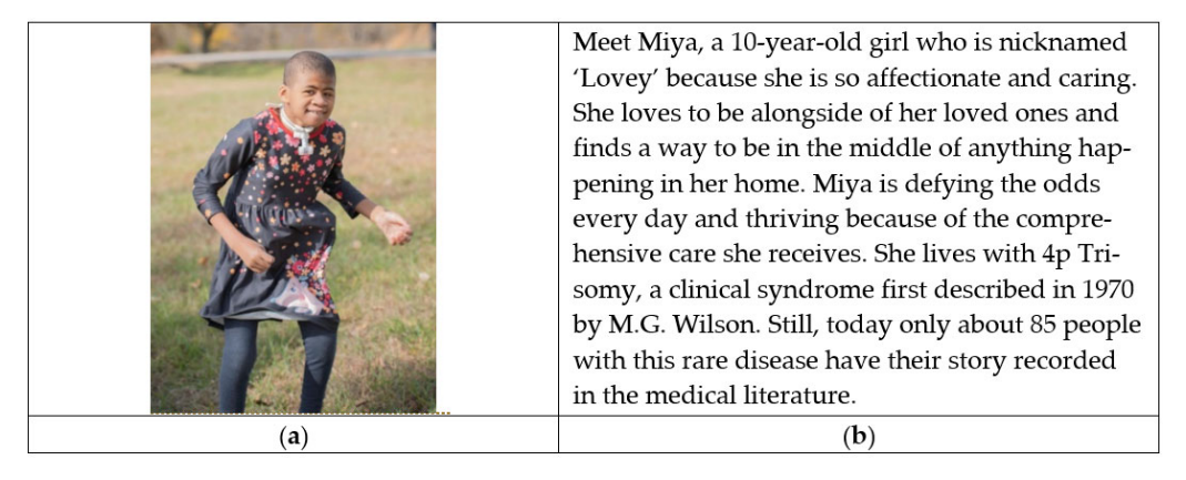
Figure 1. (a) Photo Captions: #RareDisease #RareIsntRare; (b) Miya's Story [14].

This review examines RDs and their psychosocial ramifications for children, families, and the healthcare team. The domains of the home, school, community, and healthcare are addressed, as are the implications of RD management as children transition to adulthood while families must access and advocate for their healthcare needs. To this end, matters of relevant healthcare and public policy and more sophisticated translational research that address the intersectionality of identities among RD are proposed. Finally, recommendations for evidence-based interventions and supportive care in the aforementioned domains are presented. Calls to action for families, clinicians, investigators, and advocacy agents are stated to prompt continued work toward establishing evidence-based care for these children. See Figure 1.