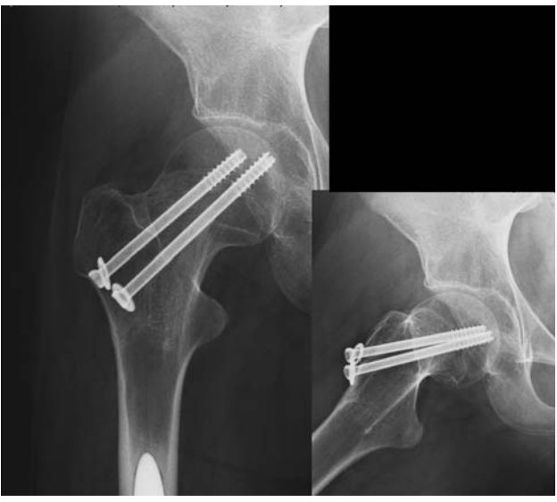
{\bf Fig.~4}~{\rm X\hbox{-}rays} showing that the fracture had healed at one year of follow up

Neoadjuvant and adjuvant chemotherapy caused a revolution in the treatment of musculoskeletal sarcoma, increasing the percentage of treatment success. The most popular treatment protocol is based on the administration of four