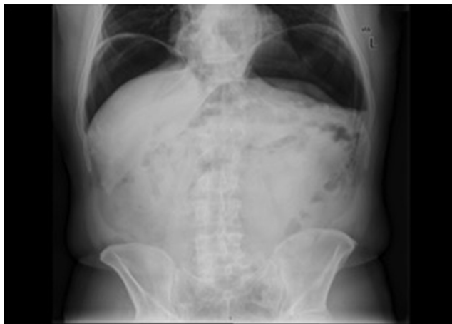
Figure 3 Plain Abdominal radiography documenting pneumoperitoneum after the iatrogenic perforation diagnosed during endoscopic mucosal resection and successfully treated with clips.

Comparing the endoscopic (n=10, G1) versus surgical (n=21, G2) approaches: