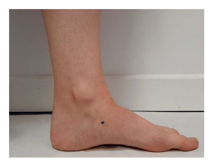
Figure 1. Signaling by a point of the most prominent aspect of the medial tuberosity of the navicular bone.