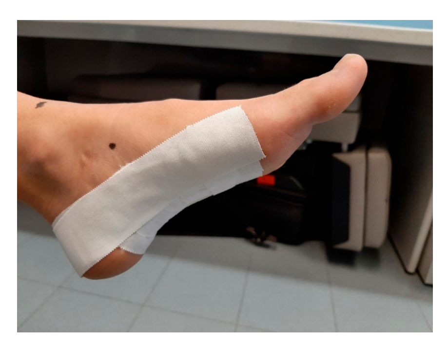
Figure 4. Low-Dye tape.