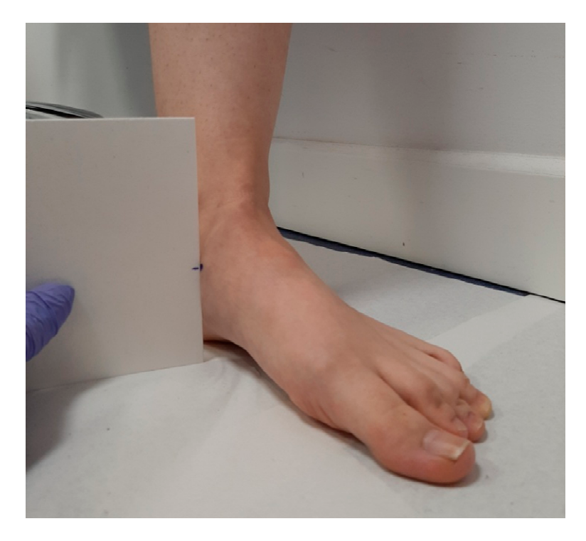
Figure 2. Measurement of the height point marked in the most prominent aspect of the medial tuberosity of the navicular bone with a neutral position of the foot.

Those with a Navicular Drop of 10 mm or less were excluded from the study [17]. The right foot was used for taping in subjects with bilateral excessive pronation [17]. The Navicular Drop test was measured in all participants by the principal researcher.