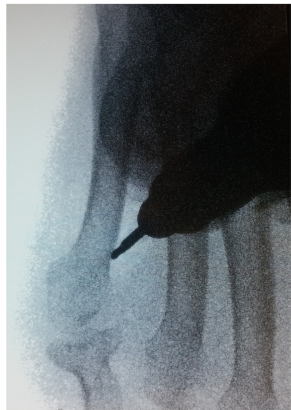
Fig. 2 Surgical procedure for metatarsal osteotomy using Shannon burr, fluoroscopic view

All patients had adequate blood supply with palpable pedal pulses or ABI index above 0.7. All ulcers were classified as University of Texas 1A (no infection, no ischemia, ulcer not penetrating to deep structures) [16] and the ulcer's mean age was 19 (median 11, range 1 to