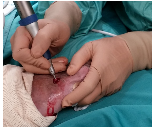
Fig. 1 Surgical procedure for metatarsal osteotomy using a 12 × 2 mm Shannon burr

Twenty procedures were performed in 17 patients; all but one were males. Their mean age was 58 (median 57, range 42 to 75, IQR 56 to 63) years. All patients were diagnosed with late-onset DM for a mean and median of 17 (range 4 to 39, IQR 13 to 20) years and their mean HbA1c was 8.1 (median 7.1, range 4.9 to 12.2, IQR 6.5 to 10.5) g/dL. One patient was post-pancreas transplantation. At the time of surgery, 11/17 patients were already being treated with insulin.