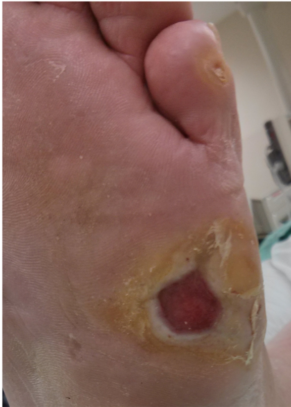
Fig. 4 Pre-operative view of chronic recurrent ulcer under the fifth MT head

(partial) osteotomy was made dorsal to the metatarsal neck, part of the neck was removed with a rongeur and the neck fractured by pushing the head dorsally. No early post-operative complications were noted. Re-ulceration developed in 6 % and transfer ulcers developed in 26.5 % of the cases 17 months following the procedure.