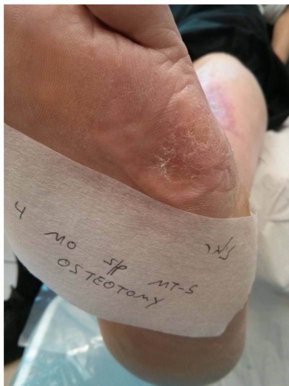
Fig. 6 Ulcer site, 4 months after surgery. The skin under the fifth MT head is almost normal

There was one post-operative infection at the osteotomy site. This osteotomy was performed at the proximal diaphysis of a fifth metatarsus for an ulcer under the head in a morbidly obese patient. The patient was not compliant and returned to work 2 days following surgery. He returned 2 weeks later with a purulent discharge from the osteotomy site. He was admitted to hospital for bone debridement and culture-directed antibiotic treatment. Eventually, he recovered with a non-union. On review of this case, we concluded that the reason for this complication was probably soft tissue damage at the osteotomy site caused by the movements of the fifth metatarsal and the long lever arm. Therefore, it is probably safer to perform a fifth metatarsal osteotomy at the neck and not in the diaphysis.