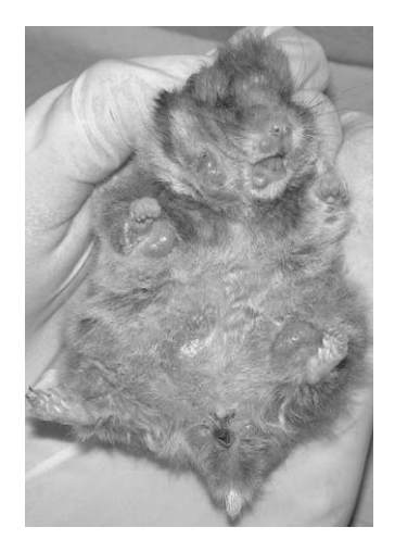
Fig. 3. Photograph of adult hamster infected with hamster polyomavirus demonstrating multiple trichoepitheliomas.

Recently, a case of naturally occurring spontaneous disease due to hamster parvovirus infection was described [44]. The disease manifested as decreased litter sizes with clinical signs in 2- to 4-week-old hamsters. Signs included dome-shaped crania, potbellied appearance, testicular atrophy and discoloration, malformation, and loss of incisor teeth. These signs were reproduced with experimental infection studies, and higher-dose experimental infections yielded a multisystemic hemorrhagic disease. A presumptive diagnosis may be made based on clinical signs and gross lesions.