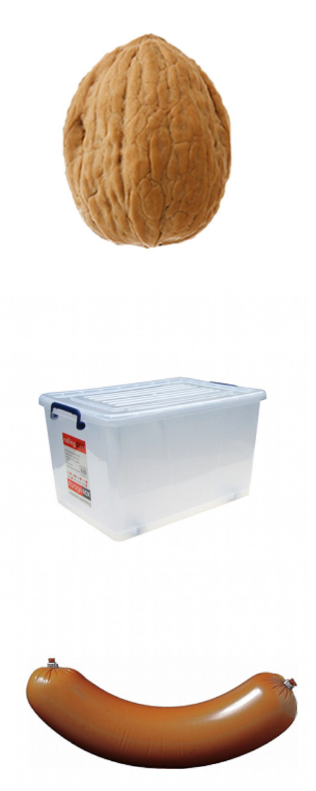
Figure 1. Example scene for the sentence "Die Box ist über der Wurst", 'The box is above the sausage'. The box is the object whose location has been described (the so called "located object") and the sausage is the object acting as a reference point ("the reference object"). The walnut is a distractor; it is not mentioned in the sentence but may capture some attention before disambiguation through the spatial preposition ("the competitor object").