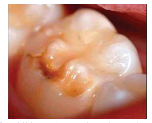
Figure 4: Molar incisor hypomineralization-demarcated opacity involving first permanent molar