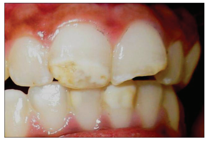
Figure 1: Molar incisor hypomineralization-demarcated opacity in relation to incisors