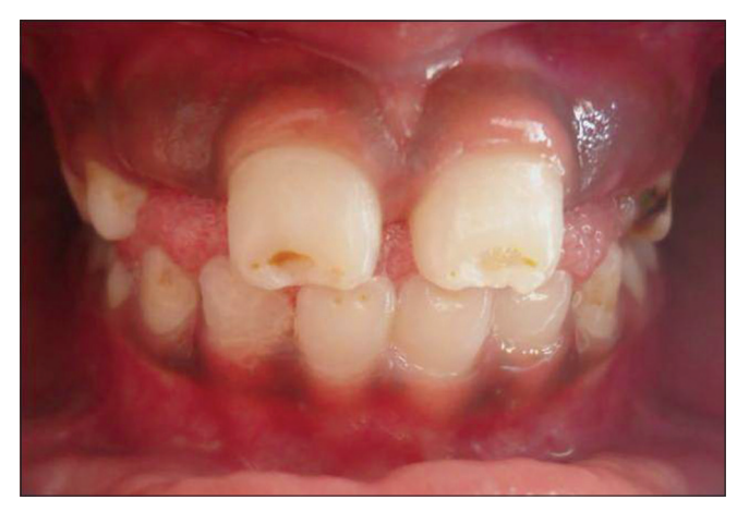
Figure 2: Molar incisor hypomineralization- showing incisors with demarcated opacities

Children of 7–9 years were selected because all four first permanent molars and incisors would have erupted into