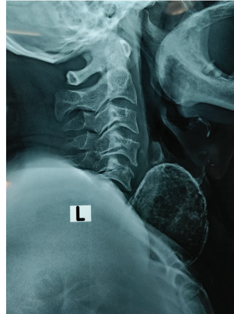
FIGURE 3: Neck X-ray radiography (lateral view) showing the calcified left lobe.

Histology of the thyroid revealed an encapsulated left lobe lesion composed of a thick fibrous wall with foci of calcification. A dense inflammatory reaction comprising lymphocytes, foamy histiocytes, and scattered multinuclear giant cells was present within the capsule. The lumen was filled with amorphous, eosinophilic material with cholesterol clefts. A thin rim of compressed thyroid tissue was noted outside the fibrous wall. Sections from the confluent nodules revealed similar histopathological features and showed encapsulated lesion surrounded by a thin fibrous capsule. They were filled with numerous foreign body type giant cells and foamy histiocytes admixed with amorphous eosinophilic