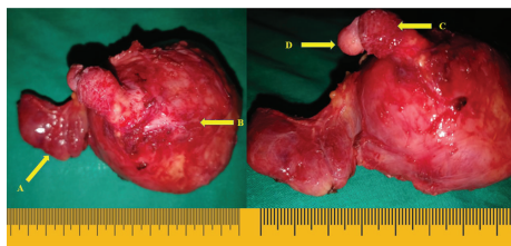
FIGURE 4: Total thyroidectomy specimen with the large hard calcified left lobe (arrow B) and nodular right lobe (arrow A) is shown. Two confluent nodules were seen in the subplatysmal (arrow C) and subcutaneous (arrow D) tissue planes extending through the deep fascia to the calcified left lobe.

calcified nodules in the superficial tissue planes which is an unusual phenomenon. The histological similarities with the main left lobe nodule suggest an origin from the thyroid gland.