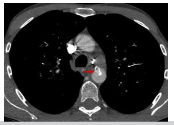
Fig 3. Follow-up computed tomography (CT) performed 2 weeks after embolization shows the in situ plug ( arrow ), embolization coils, and successful exclusion of the bronchial artery aneurysm (BAA).

reduced postoperative morbidity and faster recovery time. New technologies are also pushing the boundaries of what can be achieved by minimally invasive methods. Studies have demonstrated that both surgical and endovascular options result in similar outcomes.<sup>4</sup>