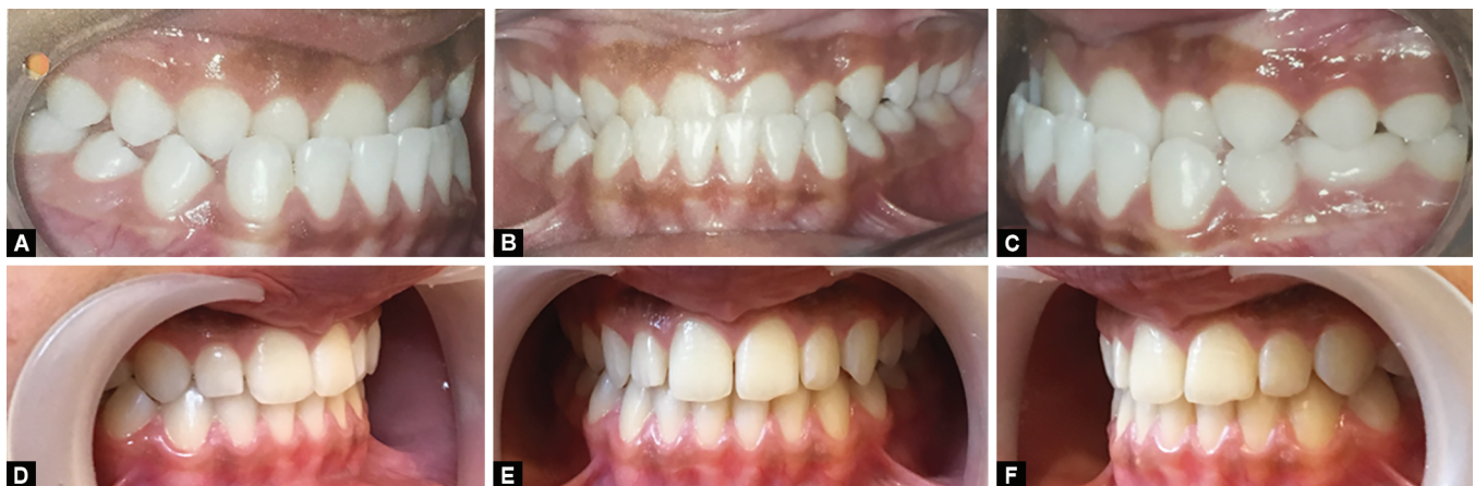
Figs 3A to F: Pseudo-class III patient; before and after treatment by Yas appliance