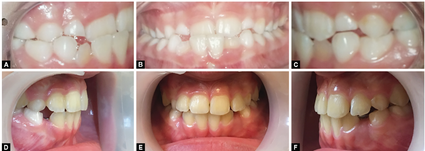
Figs 2A to F: Dental crossbite more than one tooth before and after treatment by Yas appliance