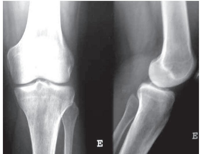
Figure 1 – Radiograph of the left knee showing no changes.

of the Hoffa fat pad between the transverse ligament and the anterior cruciate ligament, measuring 1.8 x 1.3 cm (Figure 2A, 2B, and 2C).