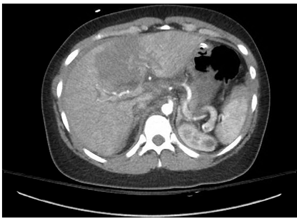
Fig. 1. CT abdomen with 6.8 cm liver laceration.

She returned the following day through the emergency room with worsening abdominal pain, mild distention, shortness of breath, and drainage from her laparotomy incision. She was diagnosed with an ileus and treated with bowel rest and intravenous hydration. She was monitored in the hospital for four days until her abdominal pain and distention decreased and she began to have regular bowel movements.