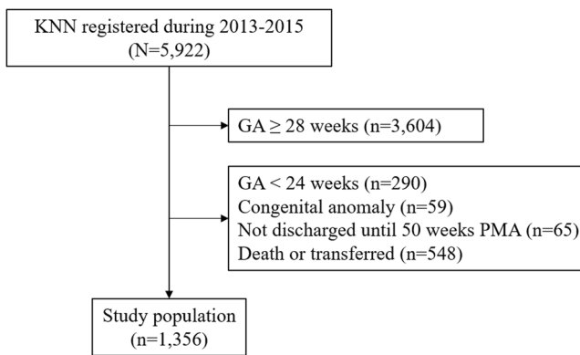
Fig. 1 Selection of study population. GA, gestational age; PMA, postmenstrual age