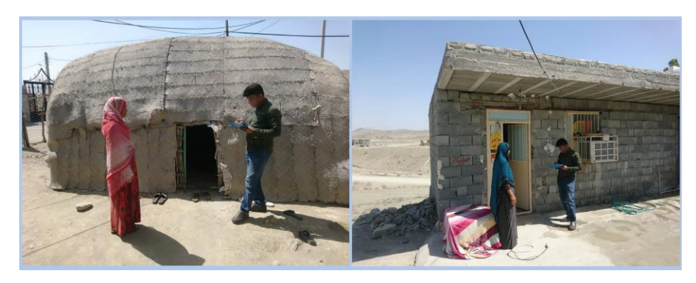
Fig. 2. Completing the questionnaire by trained interviewers in Jask County, southeastern Iran