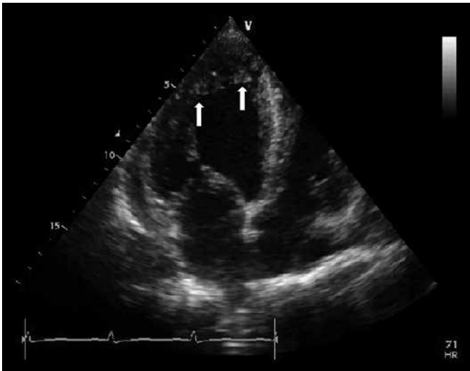
Figure 2. Transthoracic echocardiography of the patient revealing prominent trabeculations and intertrabecular recesses in the left ventricle