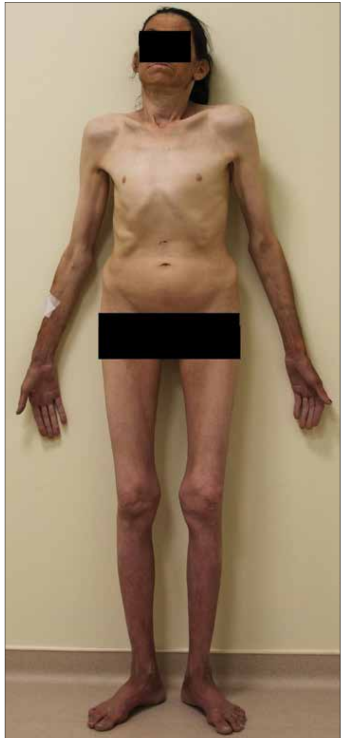
Figure 1. Gross appearance of the patient revealing macrocephaly, acromegaloid facial appearance, arachnodactyly, pectus carinatum, bilateral amazia, and mild scoliosis

chromosomal abnormalities. All 12 exons of the LMNA gene were screened for mutations by direct sequencing, but no mutations were detected. The patient was discharged on the fifth day of hospitalization. Due to non-adherence to the medical treatment, there were recurrent hospitalizations with heart failure decompensation, and she died 4 months after diagnosis.