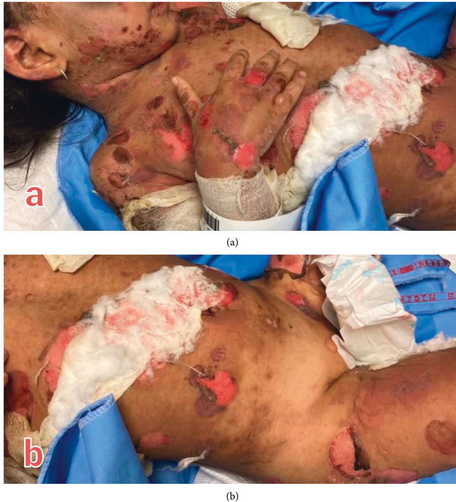
FIGURE 1: Generalized erosions and flaccid bullae (a, b).

The patient was referred to our hospital, Markaz e Tebi Atfal, Tehran University of Medical Sciences (TUMS), Tehran, Iran, at February 2021, when she was ill with generalized erythematous patches, plaques, and flaccid bullae filled with clear fluid, along with some erosions, distributed all over her body (Figure 1). Nikolsky's sign was positive.