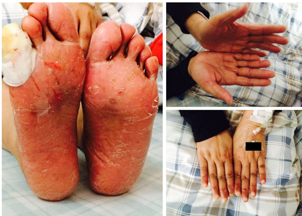
Fig. 1 The hands and feet of the patient showed obvious swelling. Diffuse erythema, hyperkeratosis, peeling, fissures with bleeding, and focal erosions were easily seen on both the sole of the foot and toes. The shallow ulcer on the fifth right toe was wetly compressed with 0.1% PVP-1 and wrapped by gauze

The random plasma glucose level (21.7 mmol/L) was significantly increased, and the potassium level (2.5 mmol/L) was decreased. The plasma and urinary ketone determinations were both negative. A standard oral glucose tolerance test (OGTT) with 75 g glucose challenge was performed. As shown in Fig. 2, the patient showed very high levels for FPG (15.3 mmol/L) and 2-h plasma glucose (25.2 mmol/L), confirming the diagnosis of diabetes (panel A). C-peptide was secreted with a normal basal level and a delayed peak concentration compared with a healthy control subject (panel B). The plasma concentration of insulin was not measured since exogenous insulin treatment was initiated immediately after admission. The plasma HbA1c level was 11.2%. All autoantibodies, including islet cell antibody, glutamate decarboxylase antibody, and insulin autoantibody, were negative. The plasma hormones, including thyroid hormones, cortisol, ACTH, aldosterone, angiotensin II, renin activity, gonadal, and gonadotropic hormones, all fell in their normal ranges (data not shown). The daily urinary potassium excretion increased (48.2 mg/day), but other electrolytes were normal.