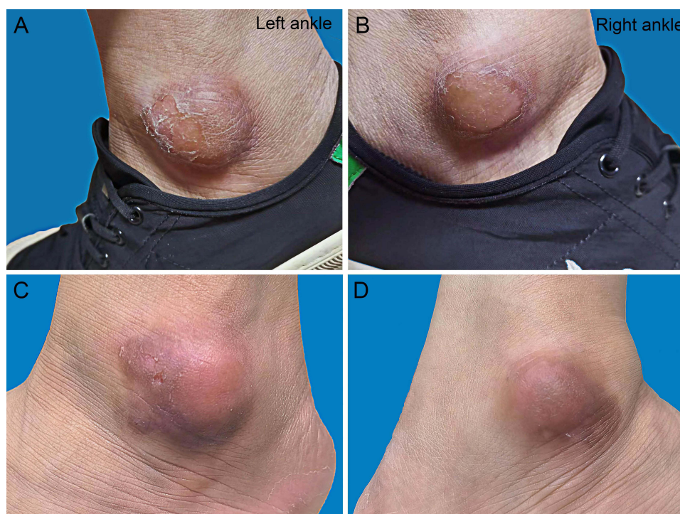
Figure 2 Plaques on both ankles before and after treatment. (A and B) Plaques on both ankles before treatment. (C and D) Two months after treatment.