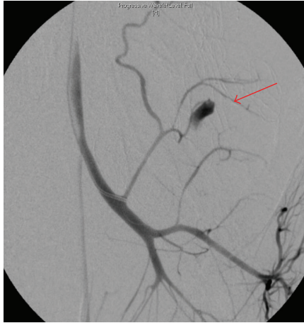
FIGURE 1: Angiography showing a blush from a dorsal branch from the left internal iliac artery (arrow).

showed a large amount of abdominal fluid and clots. Laceration of the liver or spleen due to the chest compressions during resuscitation was suspected and because of ongoing hemodynamic instability immediate laparotomy was performed. A large expanding retroperitoneal haematoma in the left lower quadrant of the abdomen was identified and explored showing a bleeding at the level of the lumbar vertebrae. Attempts were made to control the haemorrhage by suturing, application of local haemostatics, and gauze packing.