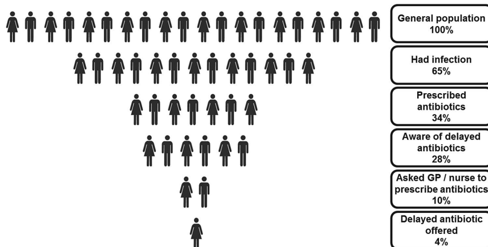
Figure 2 Percentage of the general public in the last year who reported: having an infection, being prescribed antibiotics, being aware of or practice of delayed antibiotics, asking for antibiotics, being offered delayed antibiotics (n=1625). GP, general practitioner.

group in which the full explanation was not given, and many more respondents (14.2%) reported being offered a delayed antibiotic prescription. 14 Since only 4% reported being offered a delayed antibiotic script, the questions asked only of this group of patients should be interpreted with caution due to small numbers. We did not explore why respondents were in favour or opposed to delayed prescribing—this will require further research.