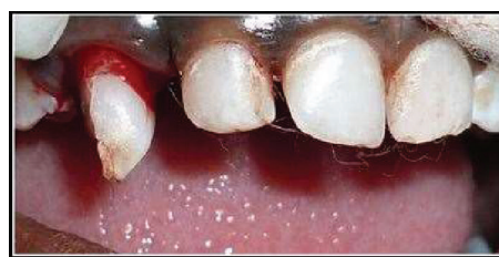
FIGURE 3: Surgically extruded 53.

in young children. Thus, a conservative approach, although it is controversial, could be adopted and attempts are made to save root-fractured primary teeth, with extraction as the last choice [6, 7].