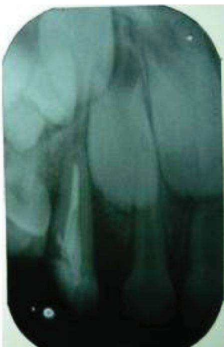
FIGURE 5: Radiograph taken at 6th-month follow-up.

Moreover, studies show that surgical extrusion has an acceptable prognosis; approximately 80% of teeth treated are still in working condition after five years [3, 4]. It is comparatively easier to get the patients' cooperation since it is a shorter-duration procedure, less expensive, and the tooth can be in function for a longer duration [1–4].