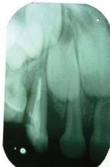
FIGURE 6: Radiograph taken at 12th-month follow-up.

In the present case report, the traumatised teeth were surgically extruded followed by the extraction of mobile tooth fragment in the coronal portion, splinted and stabilised. In the next appointment, the teeth were treated with pulpectomy and coronal restoration. On eight-week follow-up, the tooth exhibited no clinical signs of failure, such as mobility, tenderness, or pain. The outcome was successful in this case at one year, as there was no underlying pathology in the follow-up period suggesting no risk for the underlying permanent tooth germ. The long-term success of surgical extrusion depends on the cooperation of the child, the condition of the periodontal ligament, the vitality of the teeth, and the time lapsed following trauma. Thus, the conservative approach in the management of crown-root fracture in primary dentition should be emphasised. Further more studies