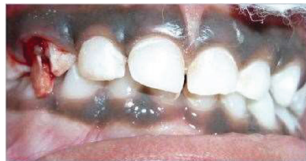
FIGURE 1: Preoperative photograph depicts fractured 53.

Crown-root fracture typically presents as a fracture line that originates in the crown portion of the tooth which extends apically in an oblique direction frequently with pulp exposure. The treatment protocol for primary teeth with crown-root fracture as recommended by IADT guidelines is to leave the tooth untreated if the coronal fragment is not displaced or extracting the coronal segment with repositioning and splinting might be considered [5]. In severe cases, when there is crown-root fracture which is extending into the subgingiva involving the primary teeth, it is indicated for extraction. As a result of this protocol, many root-fractured primary teeth were extracted in very young children. Loss of anterior teeth in these children will have negative effect on the social well-being affecting the quality of life. Surgical extraction has the potency to induce a certain amount of dental fear and anxiety