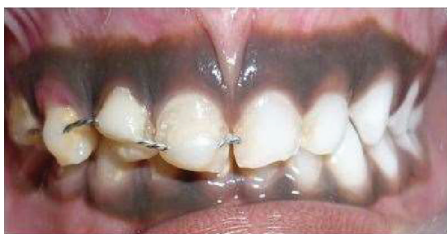
FIGURE 4: Surgically extruded 53 stabilised using composite splint.