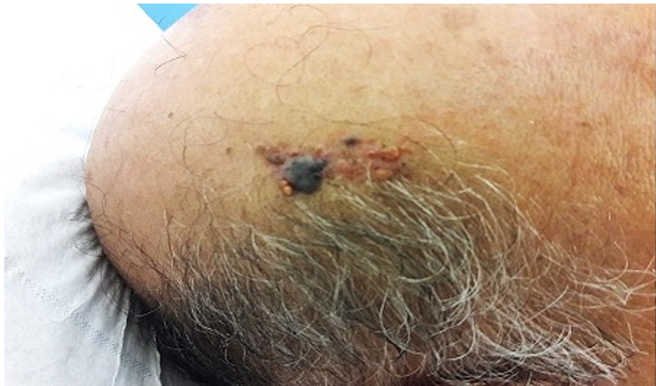
FIGURE 1: Translucent, verrucous, and yellowish plaque, with central and pigmented nodule measuring 0.7 × 0.5 cm

Also, basal cell carcinoma and trichoblastoma's diagnosis were discussed. The patient was subsequently referred to the plastic surgery department, where he underwent a total excision. The histological examination was in favour of trichoblastoma arising from the nevus sebaceus (Figure 2). After 24 months of checking, no recurrence was observed.