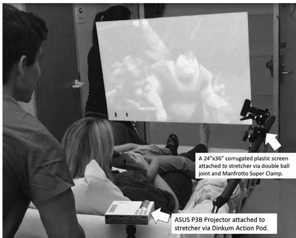
Fig. 1. BERT setup.

The effectiveness of BERT compared with midazolam was determined by analyzing whether the patient was