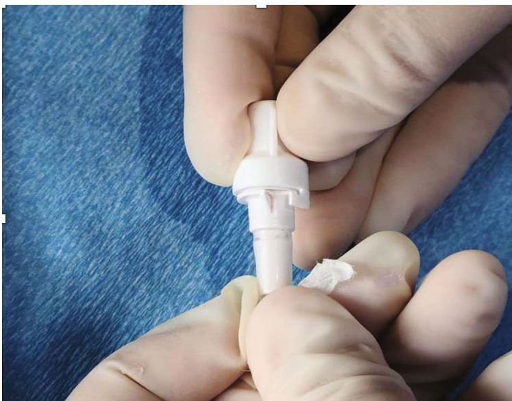
FIGURE 2: Cyanoacrylate tissue adhesive applied to the tapering end of the new drainage valve and inserted into the old catheter.