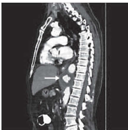
Fig. 2. Sagittal slice of an abdominal CT with contrast demonstrating the abdominal aortic aneurysm as a 'target' sign (arrow) and the hypodense area surrounding the contrast-filled true lumen as a thrombus.