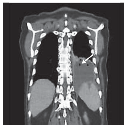
Fig. 3. The arrow shows an air bubble in the left pleural space suggestive of suppurative (gas-forming) foci with pleural effusion of heterogeneous density indicating empyema.

over the left lower lung field. A thoracoabdominal CT with contrast disclosed a 6-cm saccular abdominal aortic aneurysm (fig. 1, 2). A moderate left pleural effusion was also discovered. Thoracentesis was performed, and the effusion culture also grew S. enteritidis (fig. 3). The patient refused to undergo aortic bypass surgery, and subsequently we arranged endovascular aneurysm repair of the mycotic aneurysm. His empyema was managed with video-assisted thoracoscopic surgery. He completed a prolonged ciprofloxacin therapy of 6 weeks after an operation for eradication of the Salmonella infection. There was no recurrence within the following 6 months as confirmed by negative blood cultures.