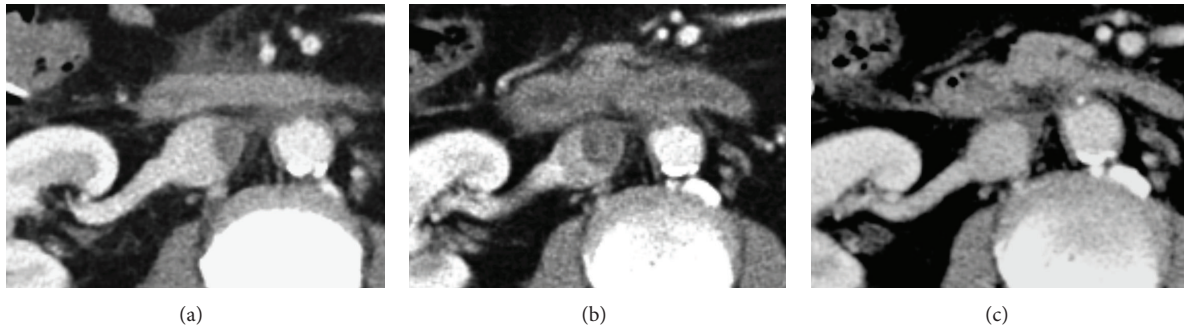
FIGURE 1: Contrast-enhanced abdominal computed tomography. (a) Mural thrombus extensively adhered to the vessel wall in the infrarenal inferior vena cava (IVC). (b) Anticoagulant therapy with unfractionated heparin and antithrombin was administered, but the IVC thrombus continued to increase in size, five days later. (c) After switching to warfarin and fondaparinux sodium anticoagulant therapy, the IVC thrombosis significantly shrank within one month.