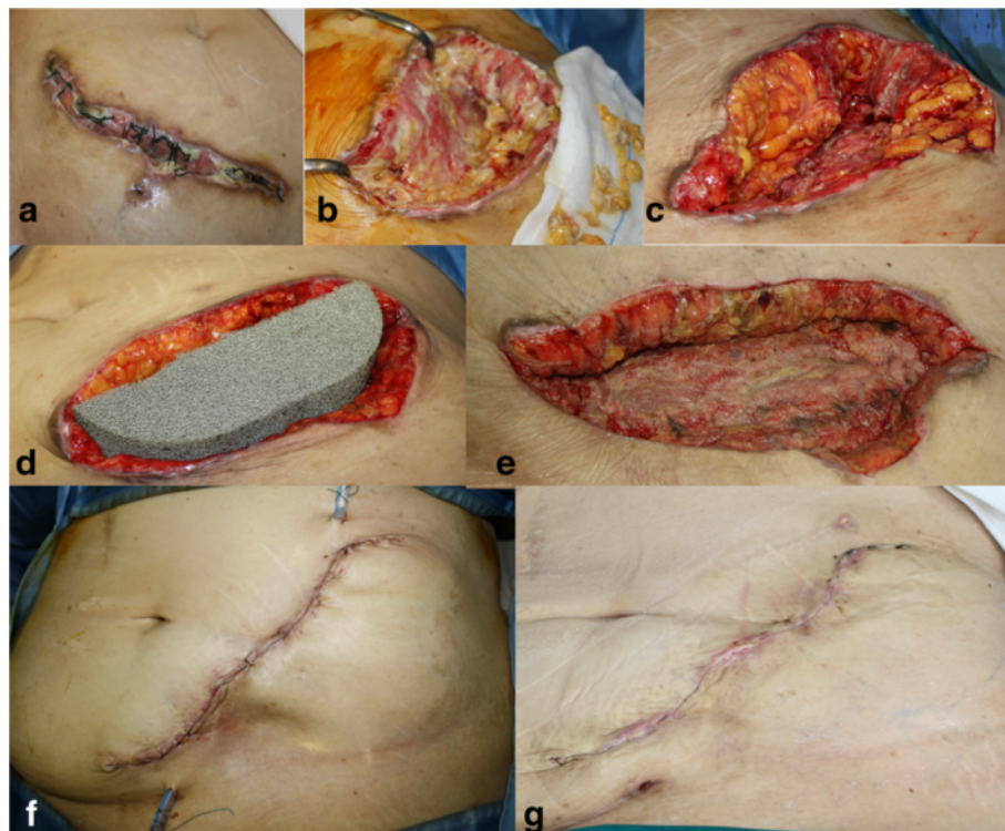
Figure 2 Phases of surgical treatment. Patient presenting with a dehiscent abdominal wound colonized by Acinetobacter baumannii after kidney transplant (a). Serial wound debridements (b, c). Negative pressure dressing (V.A.C. GranuFoam Silver®) positioned (d). Clinically satisfactory appearance, with healthy granulating tissue despite still positive microbiological cultures (e). Primary closure, 2 days post-operatively (f), and 2 weeks post-operatively (g).

The two series of patients were not different in terms of sex, age, etiology of immunodeficiency, size of the