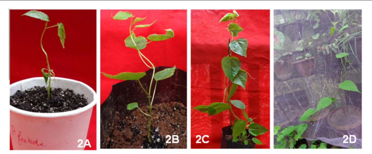
Figure 2 (A–C) Hardening of plantlets in the green house. (D) Hardened plant in the field conditions.