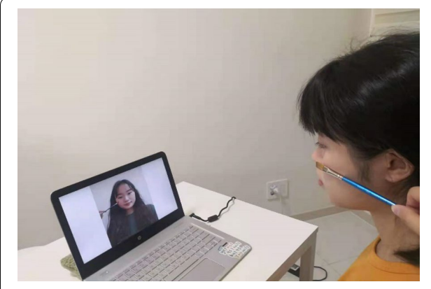
Fig. 3 Example of the procedure used to induce the enfacement illusion. Note. The participant sees another person's face in the screen being stroked by a paintbrush synchronously or asynchronously with their own face

Briefly, this theory proposes that (self) perception is a result of the brain comparing incoming sensory data with its own internal 'predictive' models based on past experiences about what is (or should be) happening. If sensory input is inconsistent with internal models, 'prediction errors' occur by which the brain attempts to re-align the incoming sensory input with the internal model, which in turn may result in illusory experiences. Therefore, the RHI can be interpreted as the result of minimising an apparent predictive error which occurs by updating one's representations of their unseen real hand's location and appearance to be more consistent with those of the rubber hand. Stated differently, the participant may infer "I feel my hand being stroked whilst seeing a rubber hand being similarly stroked at a place near where my real hand is located, therefore the rubber hand must actually be my hand". This explanation can be applied to other types of embodiment illusions that target different