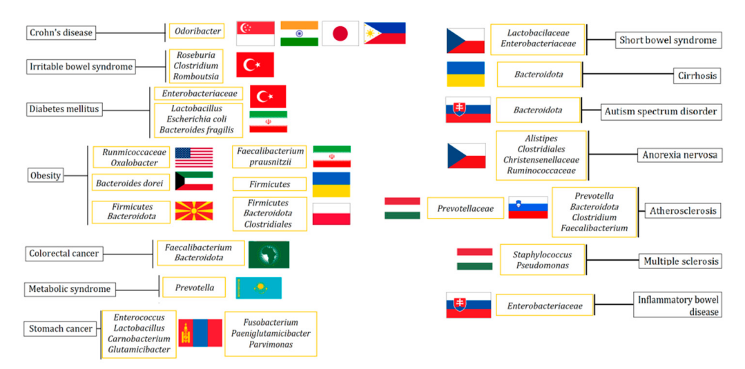
Figure 2. Bacterial taxa are typical of residents of different countries, the composition of which predominates during the development of the diseases.