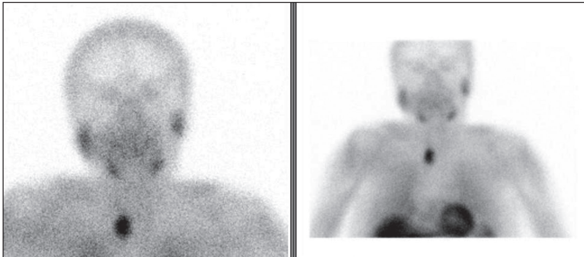
Figure 2. Anteroposterior early phase Tc-99m MIBI parathyroid planar image including the neck and mediastinum showing right upper mediastinal increased uptake consisted with the ectopic parathyroid adenoma. A 69-year-old female patient with the diagnosis of hyperparathyroidism; hypercalcemia and increased parathyroid hormone (PTH) levels and additional multinodular goiter was referred to our department for labeling for the radioguided surgery. The patient had anamnesis of bilateral total thyroidectomy due to multinodular goiter and an additional failed surgery for the parathyroid adenoma excision due to the ectopic localization of adenoma. She had previous diagnosis of incidental papillary microcarcinoma of the thyroid gland. Persistent hypercalcemia and hyperparathyroidism were observed after the two operative procedures. Parathyroid scintigraphy was performed by intravenous injection of 370 mBq Tc-99m MIBI with low energy high resolution collimator equipped double head SPECT gamma camera prior to the surgery. The clear demonstration of a parathyroid adenoma in planar images obviated the need for SPECT imaging. The patient was