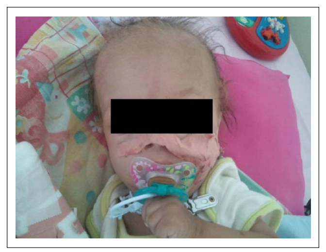
Figure 1. The infant at the age of 11 months.

At the age of 6 months, the infant was readmitted at our pediatric department and remained hospitalized due to persistent diarrhea, failure to thrive (body weight and body length <3rd percentile, 5.5 kg and 60 cm, respectively) and