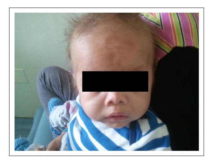
Figure 2. The infant at the age of 15 months.

the need for nutritional support. The infant's clinical characteristics, which were prominent forehead and cheeks, broad nasal root, widely spaced eyes (hypertelorism), wooly hair that was easily removed and poorly pigmented at the age of 11 months, are shown in Figure 1. Further investigation showed a mild congenital heart atrial septal defect, while hospital discharge was not feasible because of an unsafe living environment due to the low socioeconomic and educational status of the family and parents' feeling of insecurity.