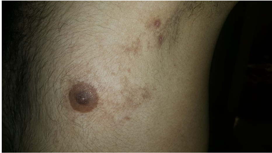
FIGURE 5: The lesions resolved with post-inflammatory hyperpigmentation spontaneously within two weeks.

Based on the clinical and histopathological features, the diagnosis of AB with spongiotic dermatitis and the coexistent lichenoid infiltrate with eosinophils was considered. The patient was prescribed topical mometasone cream 0.1% and a poor compliance was reported but was nonetheless satisfied with the outcome. CBC repeated after 12 weeks revealed no eosinophilia and there was no recurrence of lesions.