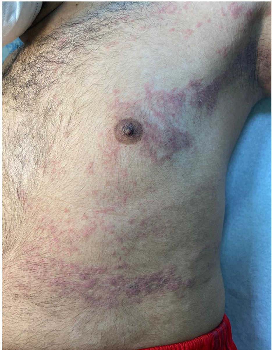
FIGURE 1: Spread of deep-seated vesicles on the arm, trunk, and lower extremity.

There was no personal history of atopy, insect bite, drugs, or recent infection, nor a family history of similar presentation. On examination, unilateral erythematous edematous papules, plaques, and papulo-vesicles over the left side of the body were observed, as seen in Figure 2.