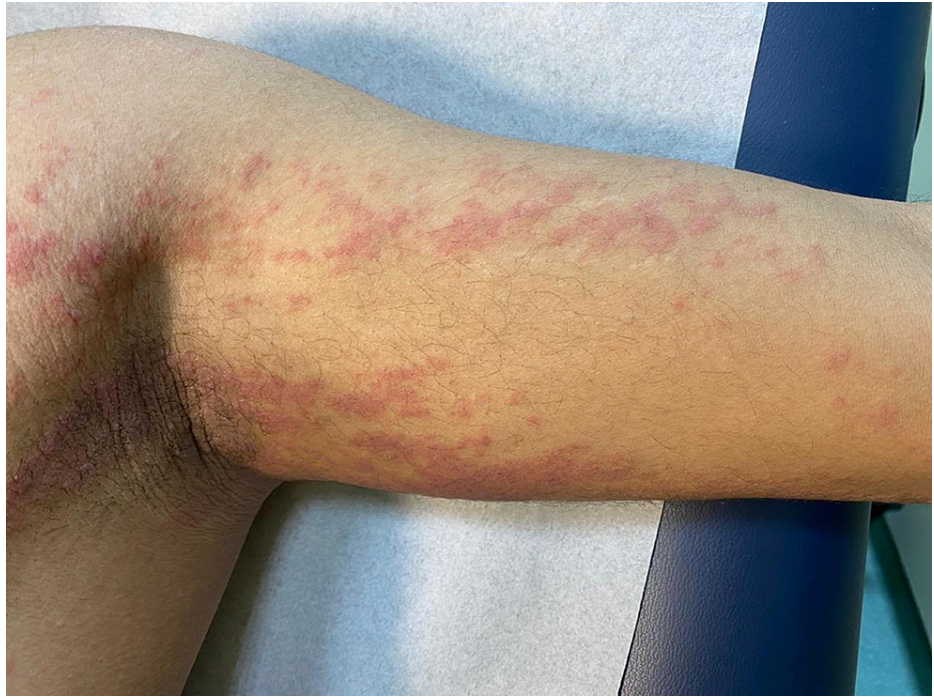
FIGURE 2: Unilateral erythematous edematous papules, plaques, and papulo-vesicles over the left side of the body.

The lesions were following BL as whorls and interrupted lines. Nails and mucous membranes were spared. Complete blood count (CBC) showed hemoglobin and white blood cell count to be within normal limits and eosinophilia of 10.6%. Additionally, renal and liver functions were normal, hepatitis B screening was negative, and antinuclear antibody and stool analysis were negative.