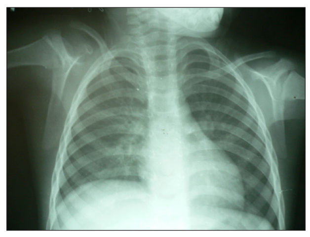
Figure 3: X-ray chest after retrieval of foreign body showing no abnormality

Figure 2: Foreign body retrieved from right main bronchus