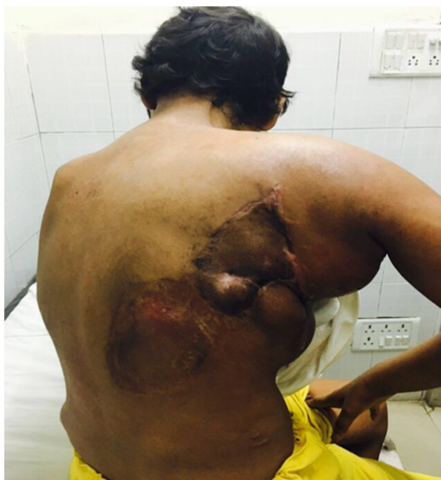
Fig. 5. Donor site of latissimus dorsi flap with multiple subcutaneous nodules over her back.

Now the patient again came with recurrence after 5 months, and disseminate subcutaneous nodules over upper abdomen of size 6*6 cm, back, scalp, neck and both forearm. There is a hard lump in