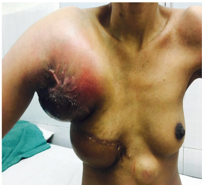
Fig. 4. An axillary mass, recurrent right breast mass, an epigastric mass.